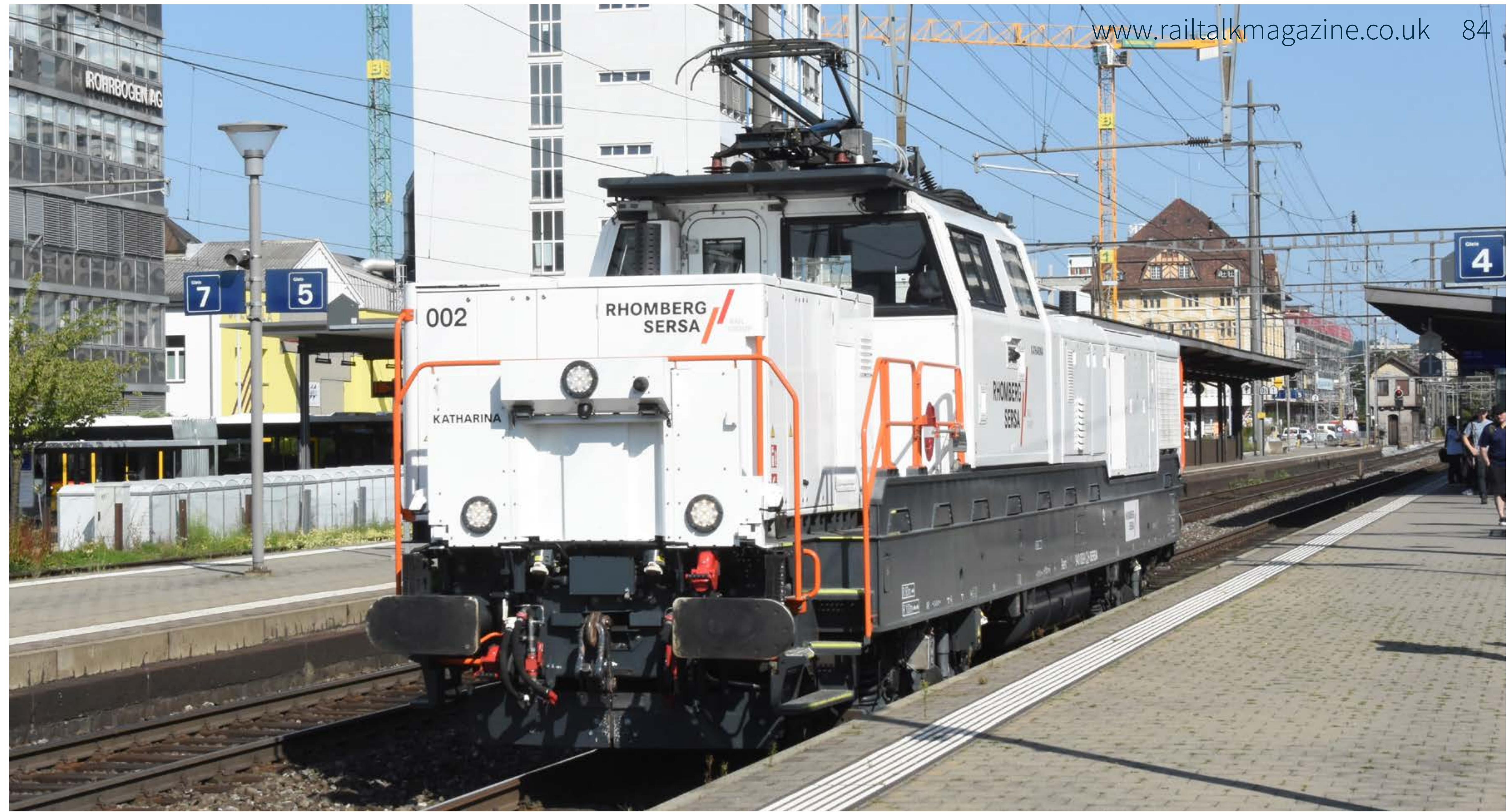
▶ SBB Class 841.025 is seen shunting at Mohlin on August 30th.