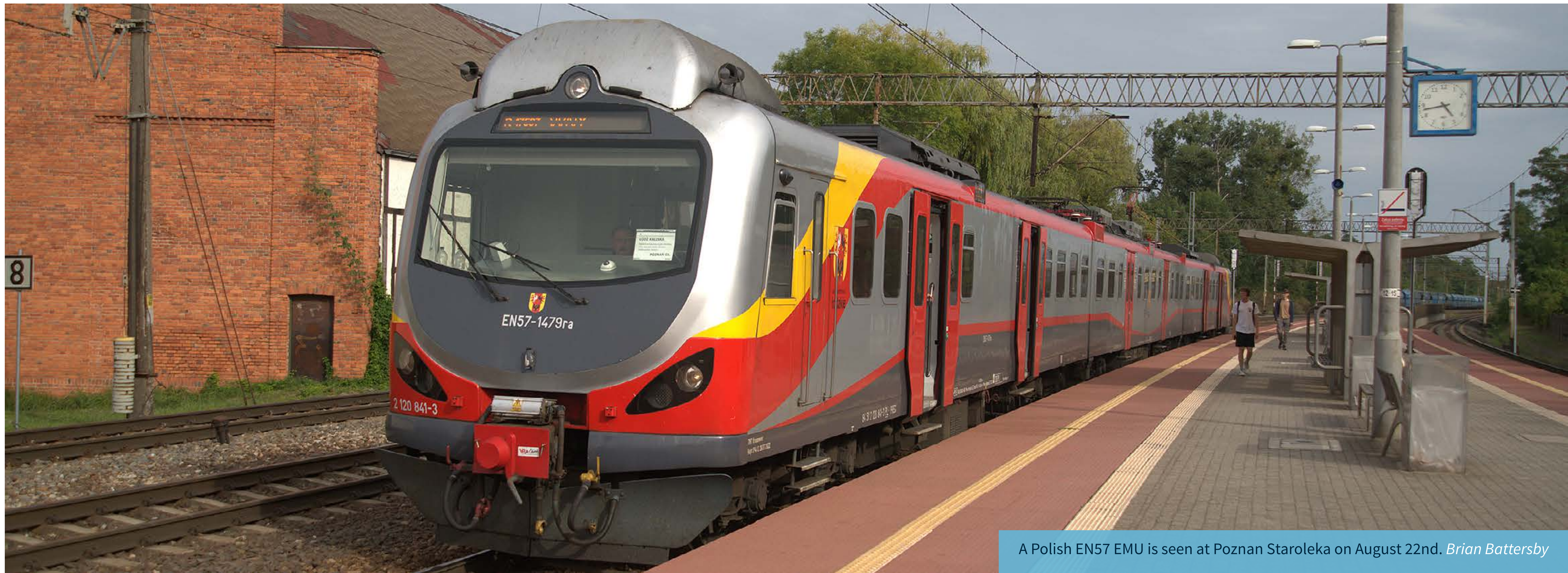
A Polish EN57 EMU is seen at Poznan Staroleka on August 22nd.