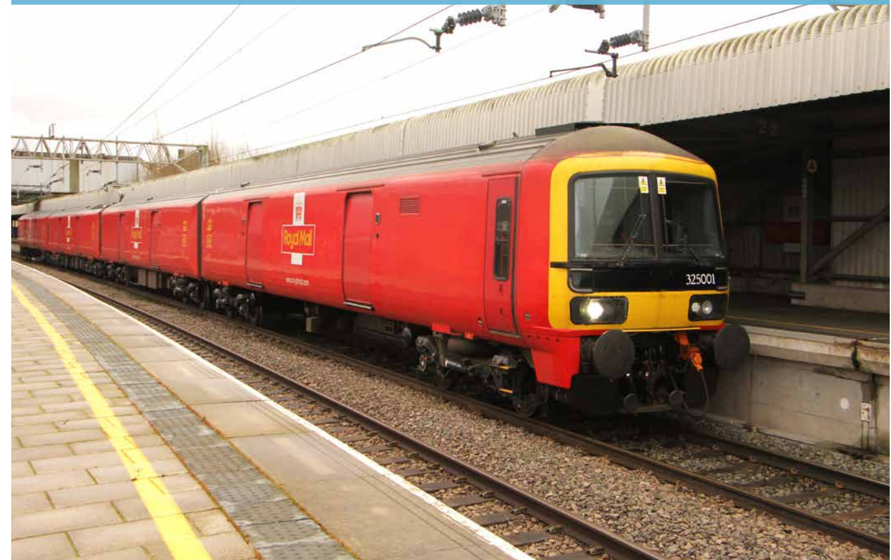
Class 325 001 stands at the old Royal Mail platform at Stafford with the return 5K21 12:28 Stafford to Crewe T.M.D. (E) test run on December 22nd. Derek Elston

The trial will determine whether tickets bought from ticket vending machines can also be brought in line with this more convenient and faster method of passing through the ticket barriers.