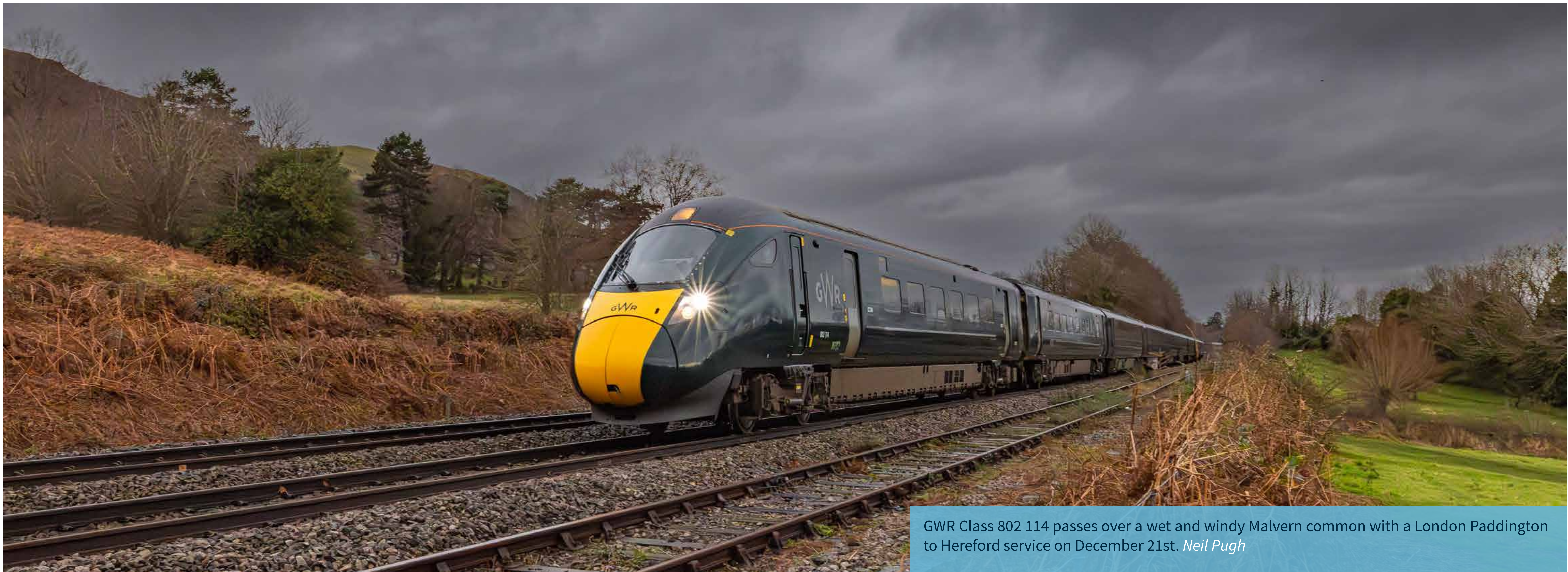
GWR Class 802 114 passes over a wet and windy Malvern common with a London Paddington to Hereford service on December 21st.