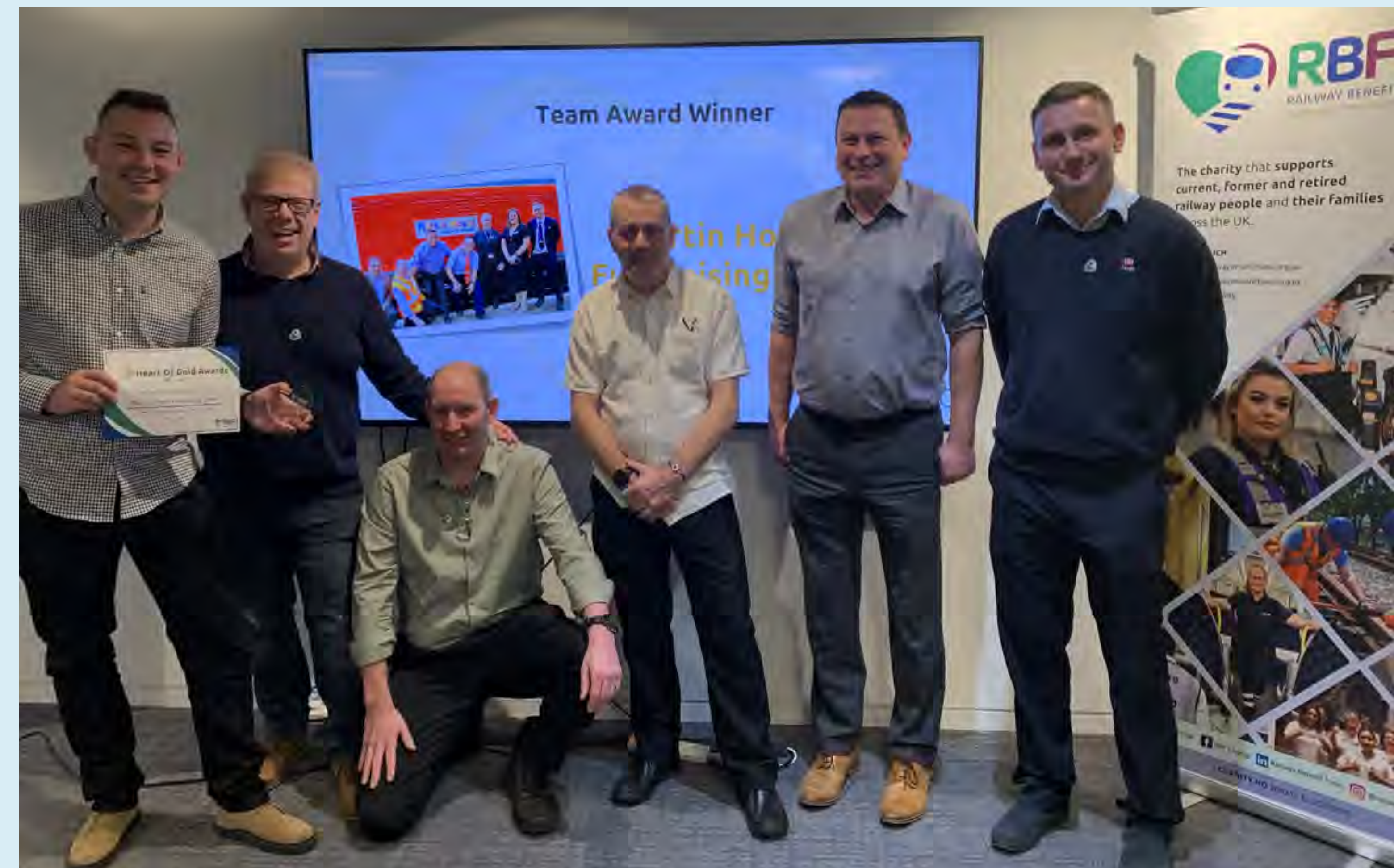
Photo: Network Rail and DB Cargo staff win Heart of Gold award.

grateful for their ongoing commitment to raising both awareness and funds for Martin House. Huge congratulations to them and all involved!"