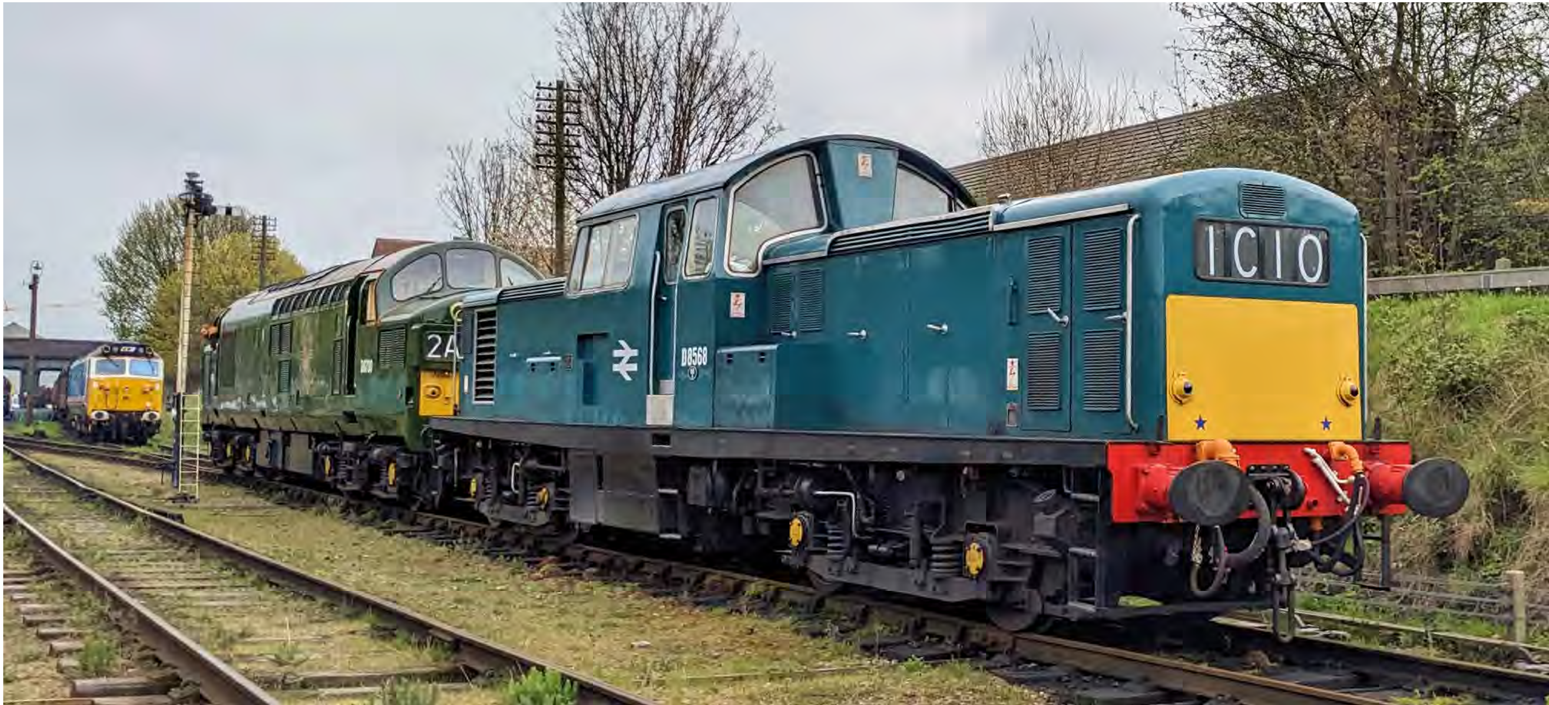
Unusual, unique diesel loco visits line for first time.

Thousands of enthusiasts packed trains at the Great Central Railway as vintage diesel took centre stage for a gala. Steam power was side lined for the weekend as different locomotives dating from the 1950s and 60s wowed visitors.