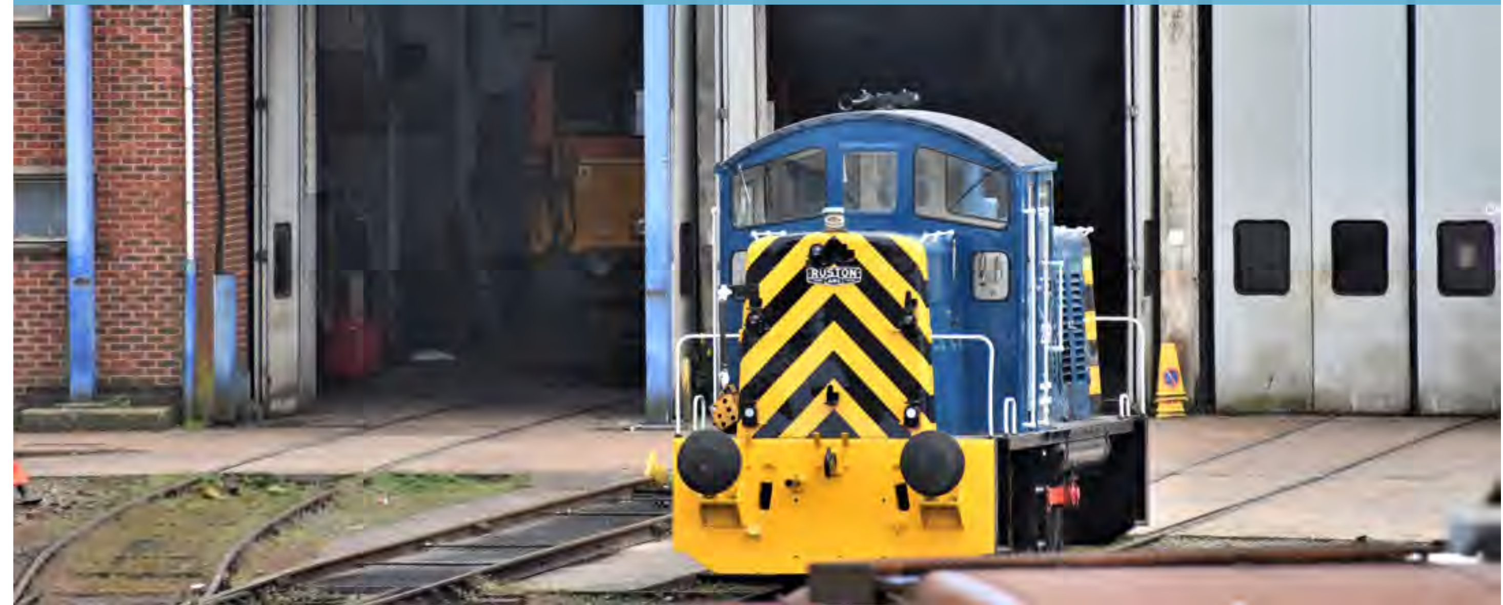
Ruston Class 07 No. 2991 stands outside Eastleigh Works on April 26th.