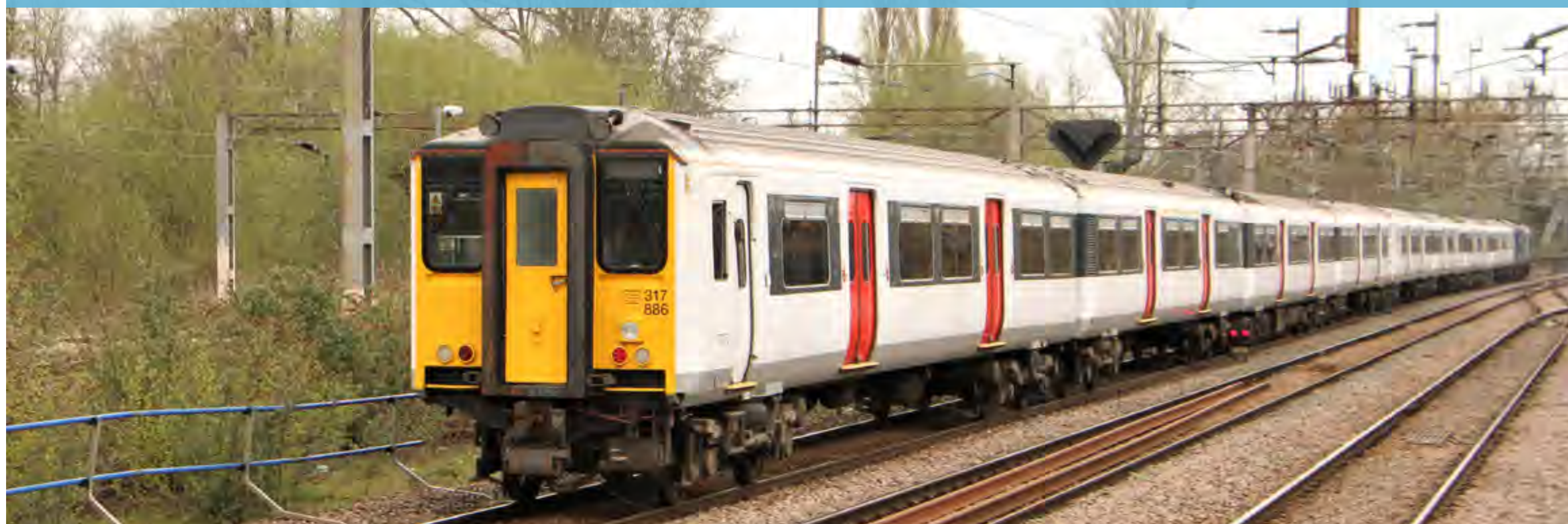
Farewell to Class 317 886 and 317 884 as they pass through Northampton en route to the scrapyard behind Class 37 800 as 5Q68 08:59 Ely Mlf Papworth Sidings to Kingsbury Sidings on April 19th. Derek Elston