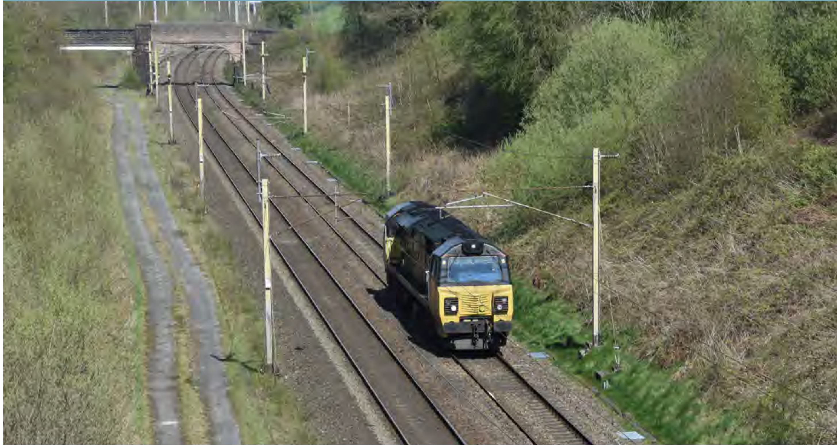
Colas Rail's Class 70 813 runs through Charnock Richard cutting during a move from Carlisle to Rugby on April 18th.