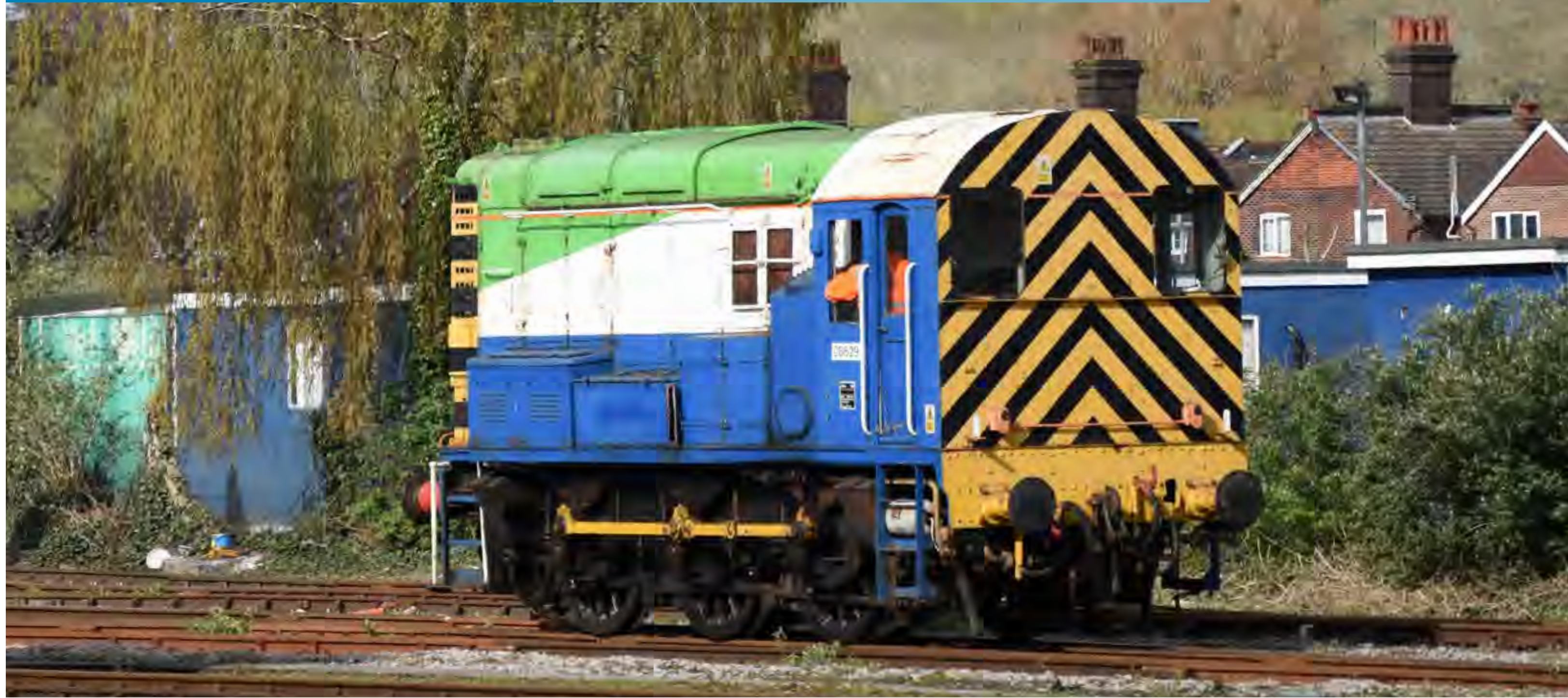
Class 08 629 is seen engaged in shunting operations at Eastleigh Yard on April 25th. John Sloane