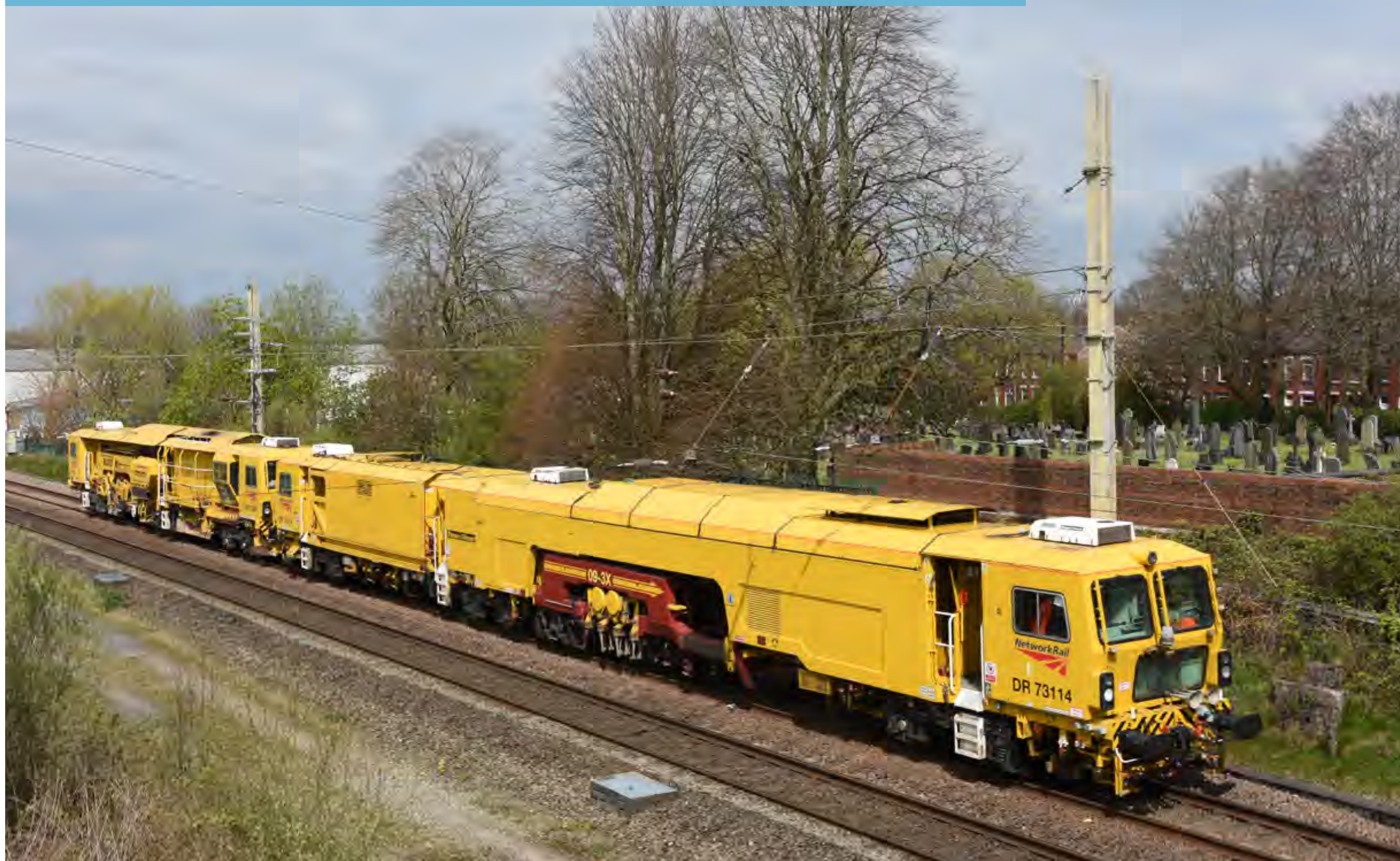
A pair of track machines pass through Coppull Moor whilst working from Carnforth to Crewe on April 19th.