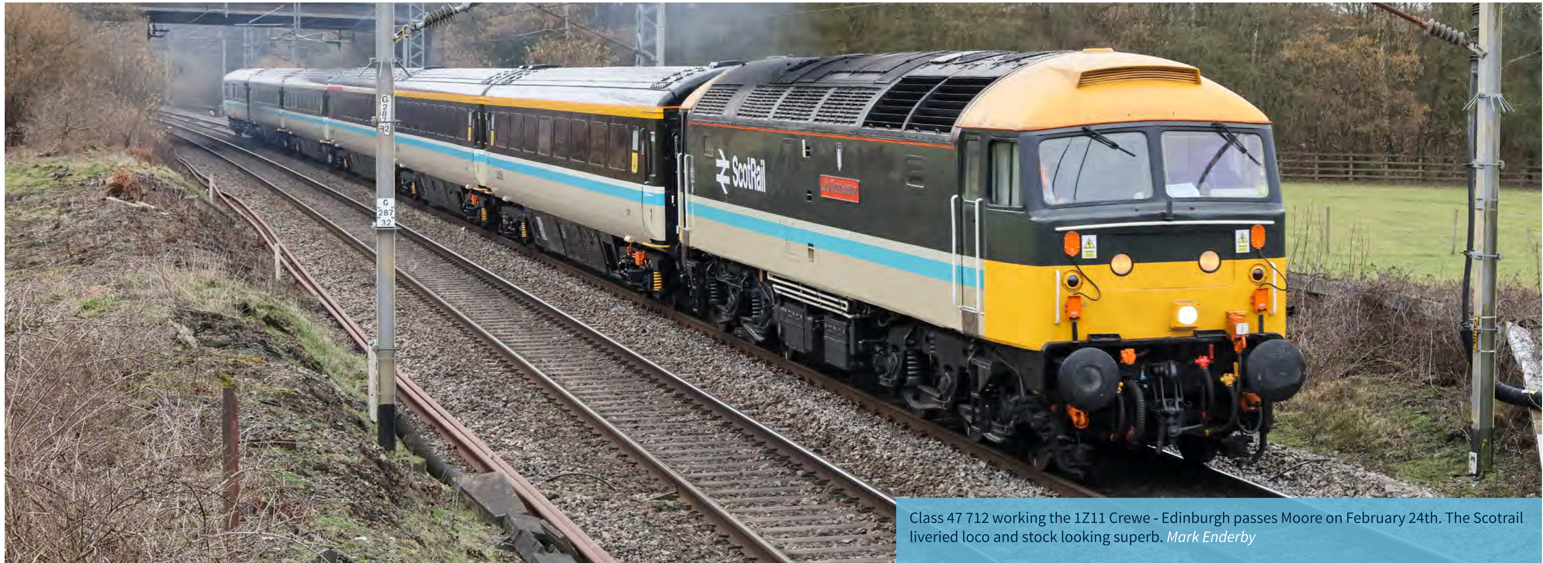
Class 47 712 working the 1Z11 Crewe - Edinburgh passes Moore on February 24th. The Scotrail liveried loco and stock looking superb. Mark Enderby