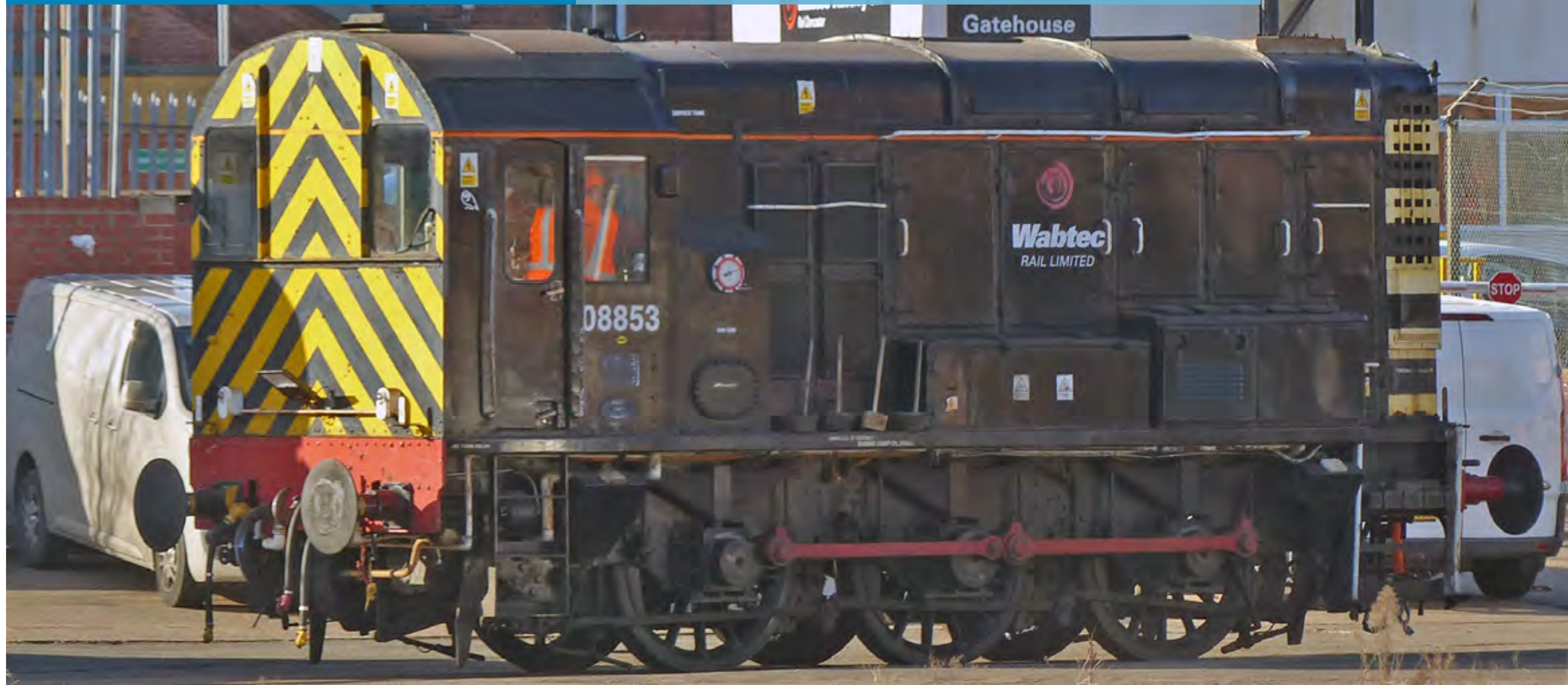
Wabtec's Class 08 853 is seen in operation at Doncaster on February 9th.