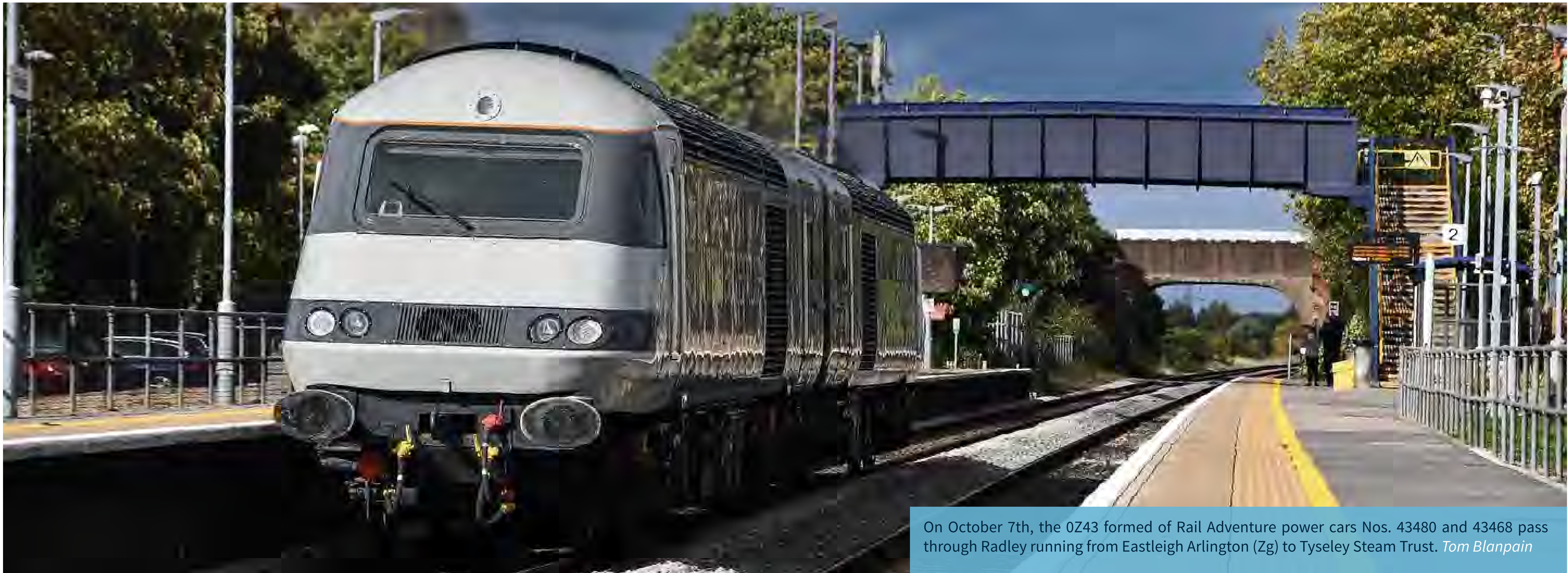
On October 7th, the 0Z43 formed of Rail Adventure power cars Nos. 43480 and 43468 pass through Radley running from Eastleigh Arlington (Zg) to Tyseley Steam Trust.