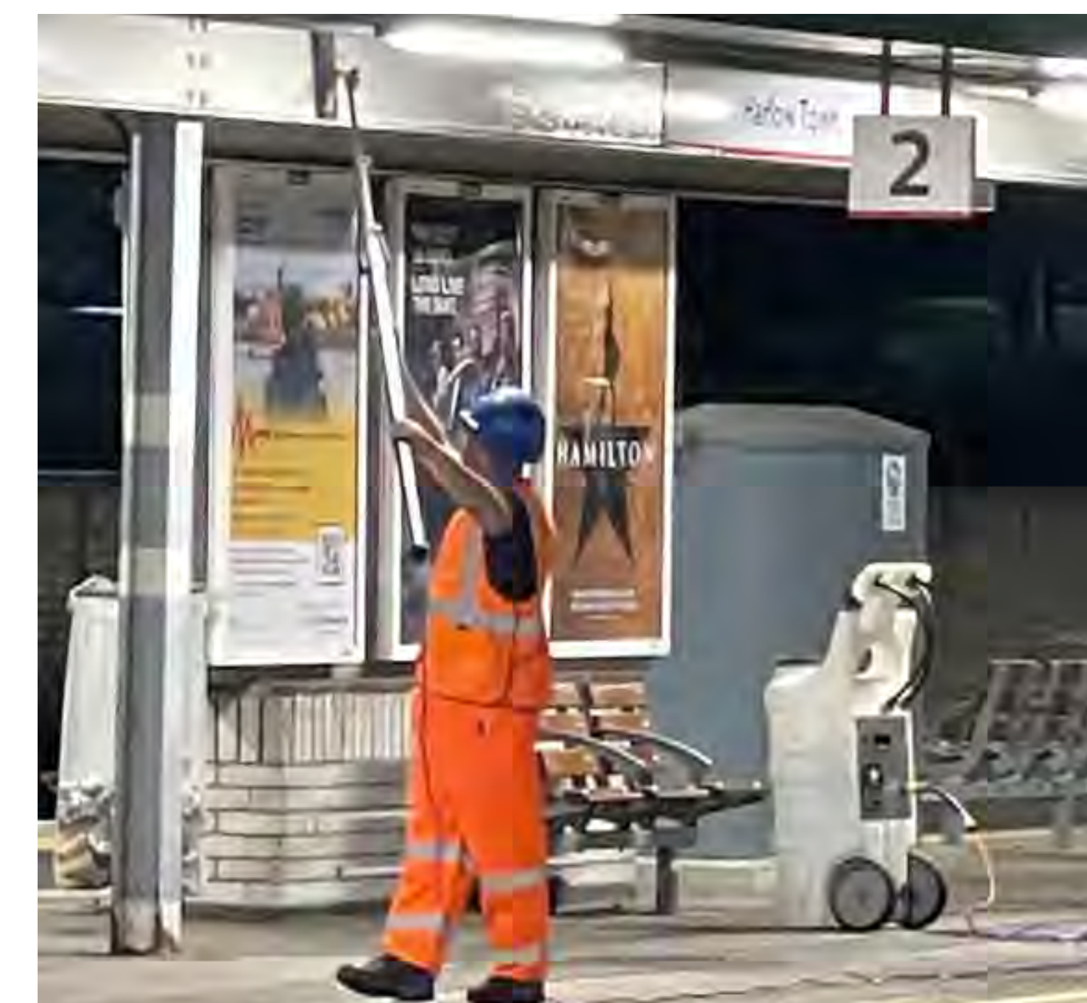
Photo: High level cleaning at Harlow Town station. ©Greater Anglia

Greater Anglia uses a range of initiatives to keep stations clean, including a robot which is used to clean concourses at Norwich and Southend Victoria stations and gumbuster machines to clean up chewing gum.