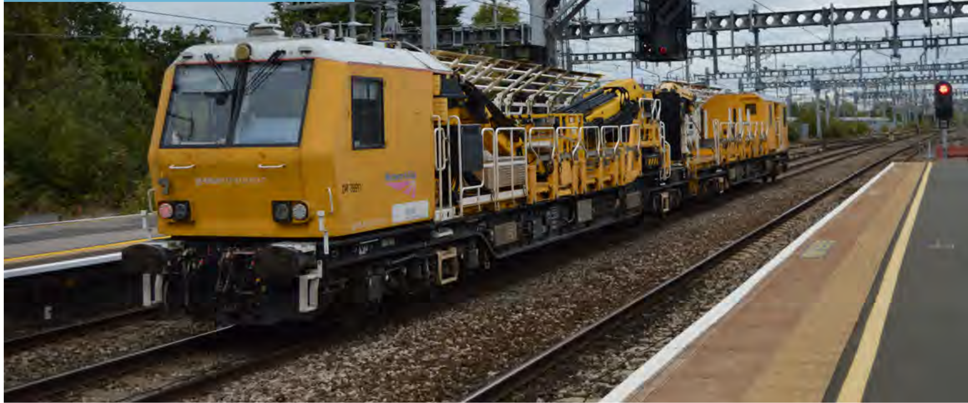
On October 7th, Network Rail's MPV Nos. DR76913 and DR76911 pass through Swindon.