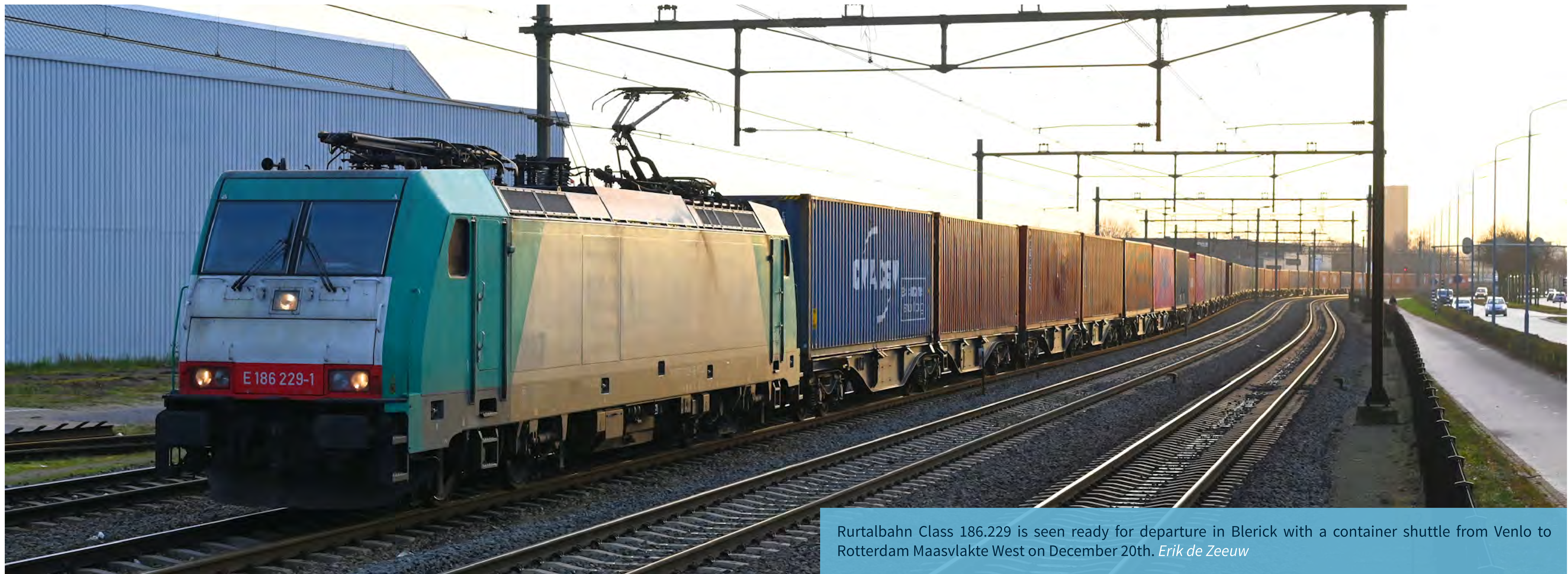
Rurtalbahn Class 186.229 is seen ready for departure in Blerick with a container shuttle from Venlo to Rotterdam Maasvlakte West on December 20th. Erik de Zeeuw