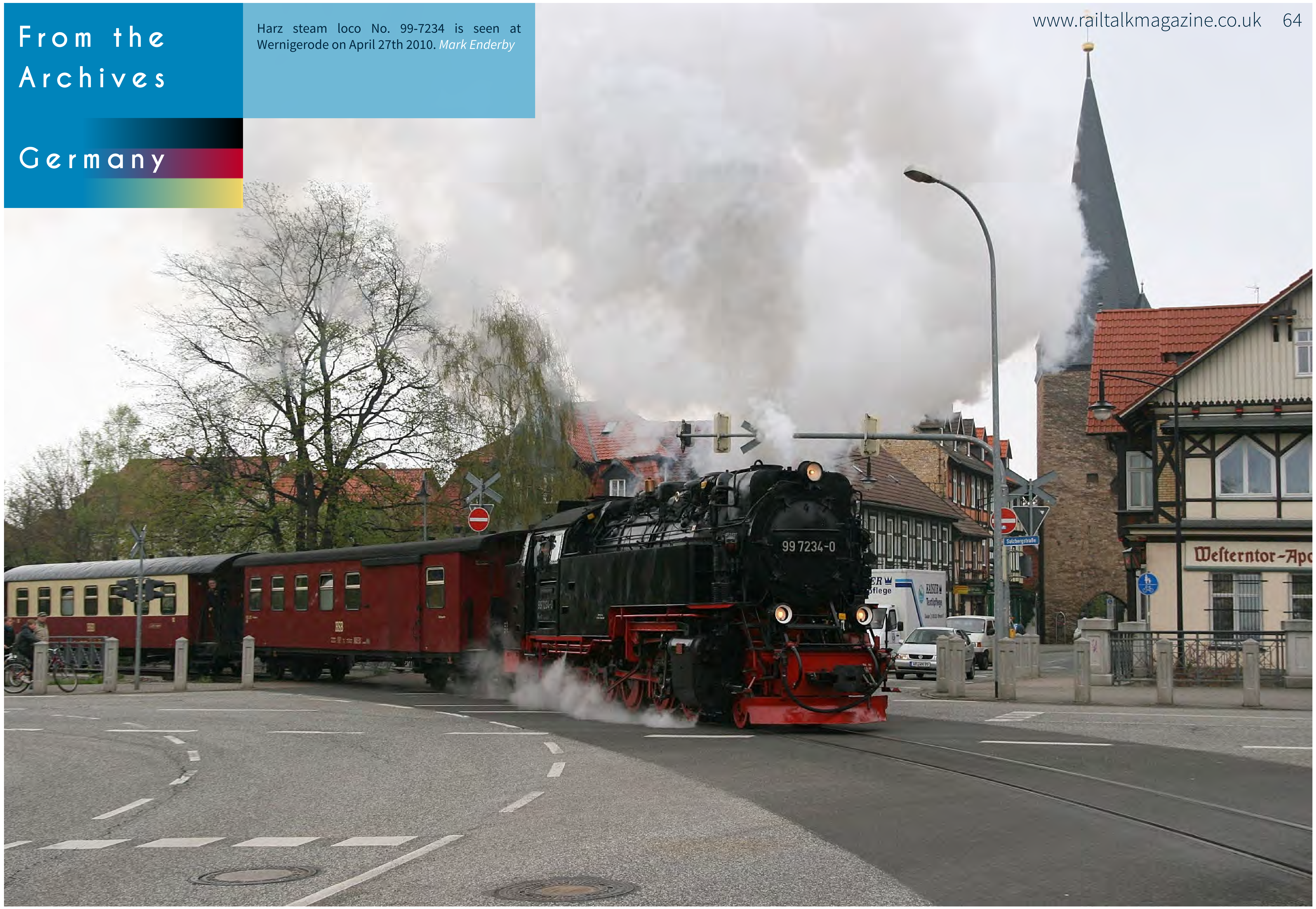
Harz steam loco No. 99-7234 is seen at Wernigerode on April 27th 2010. Mark Enderby