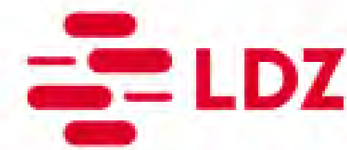
Development of the Latvian railway infrastructure for increasing speed of passenger trains

In recent years, “Latvijas dzelzceļš” has already implemented infrastructure upgrades in certain railway sections in order to increase the maximum speed of trains and therefore shorten the time passengers spend on trains. At present, the maximum speed of passenger trains in Latvia is 120 km/h.