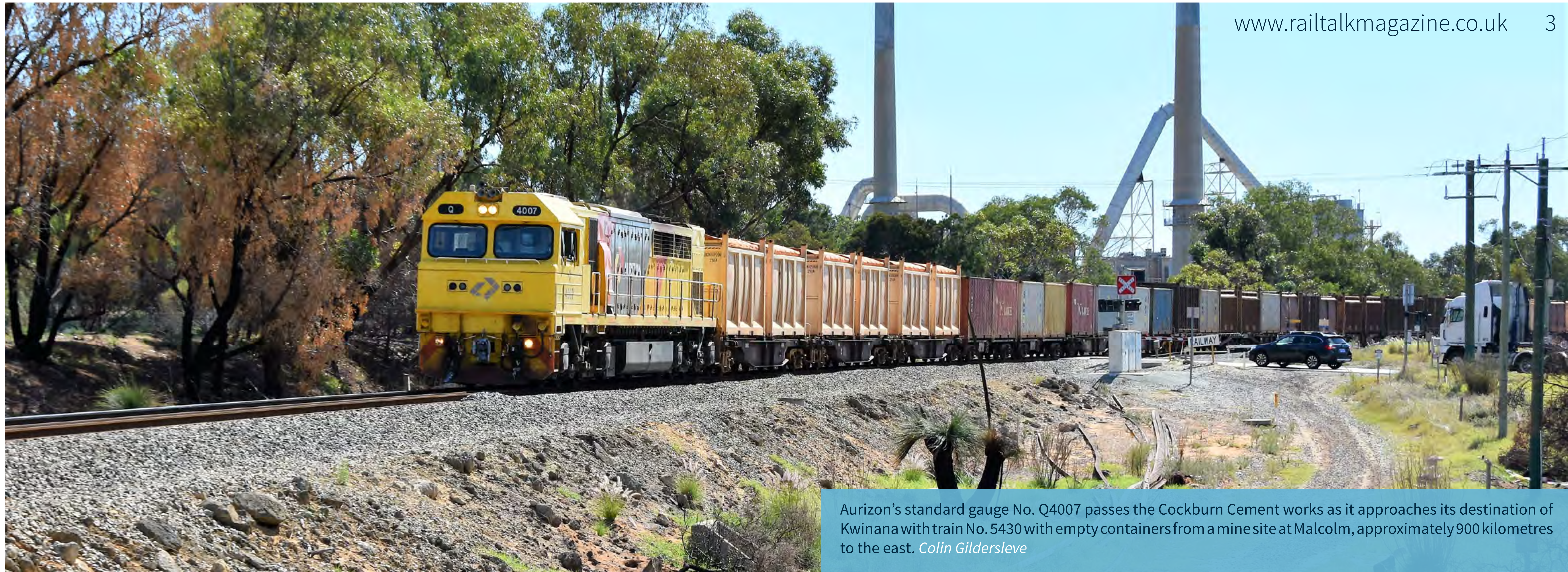
Aurizon's standard gauge No. Q4007 passes the Cockburn Cement works as it approaches its destination of Kwinana with train No. 5430 with empty containers from a mine site at Malcolm, approximately 900 kilometres to the east. Colin Gildersleve