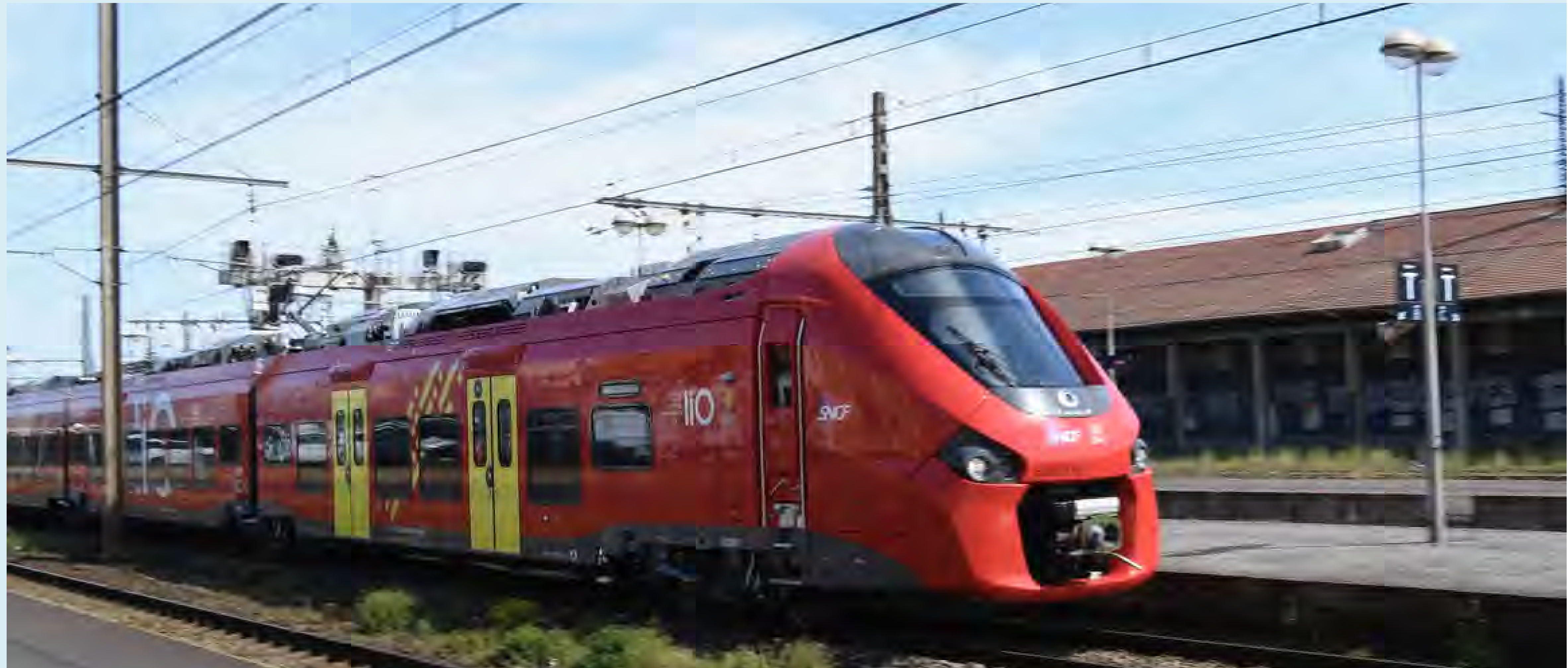
Photo: Coradia Polyvalent Occitanie.

Alstom and its suppliers. Six of Alstom’s twelve sites in France are involved: Reichshoffen for the design and assembly, Ornans for the engines, Le Creusot for the bogies, Tarbes for the traction chains, Villeurbanne for the on-board systems and Saint-Ouen for the design.