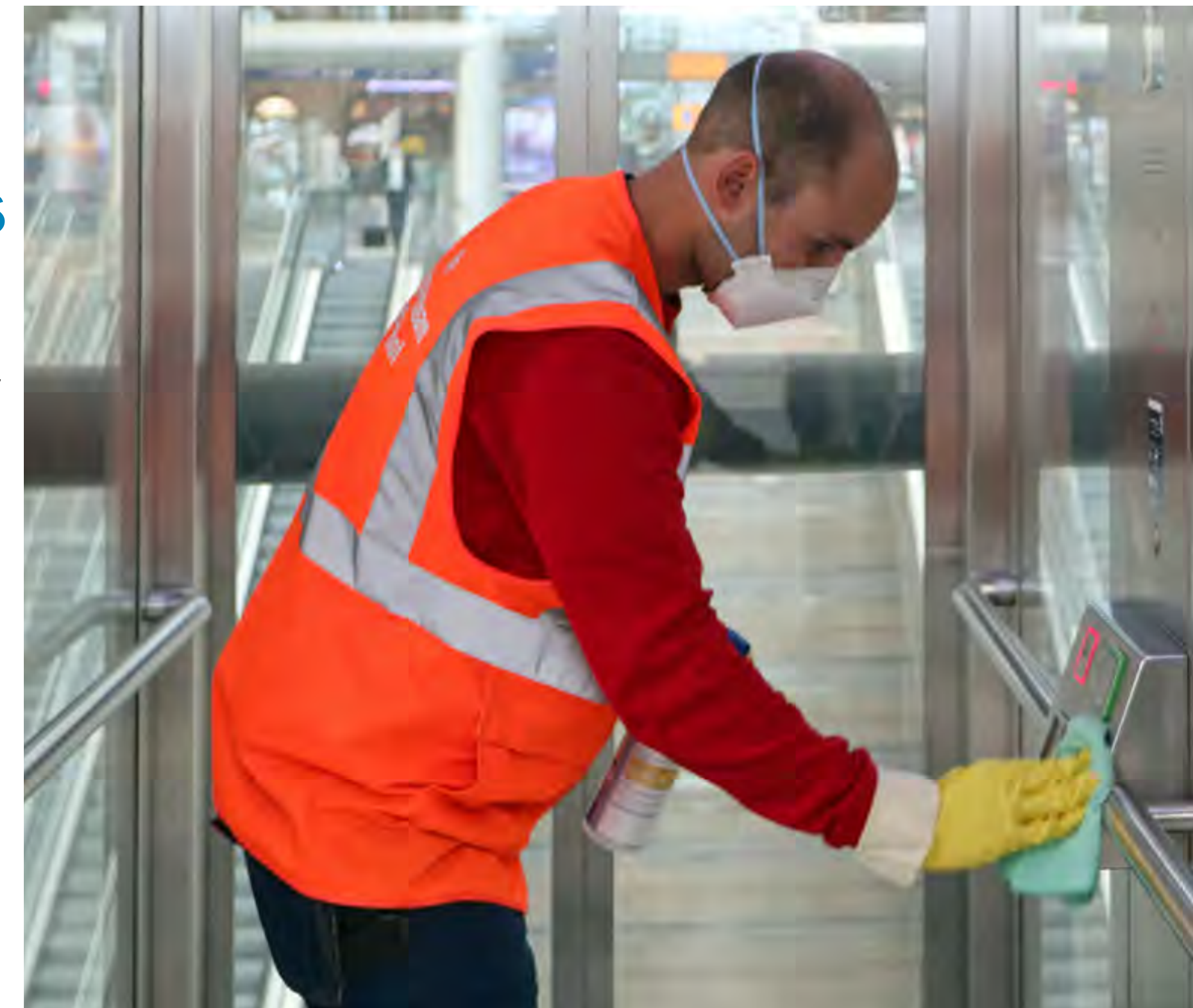
Photo: An employee at Leipzig Central Station cleans and disinfects contact areas several times a day

DB is also testing innovative technologies. In selected locations, disinfectant paints on elevator buttons and stair handrails should ensure that bacteria and viruses are combated with great effectiveness. In Frankfurt am Main and Düsseldorf, UV-C light disinfects the handrails of escalators. 99 percent of all bacteria and viruses are safely killed.