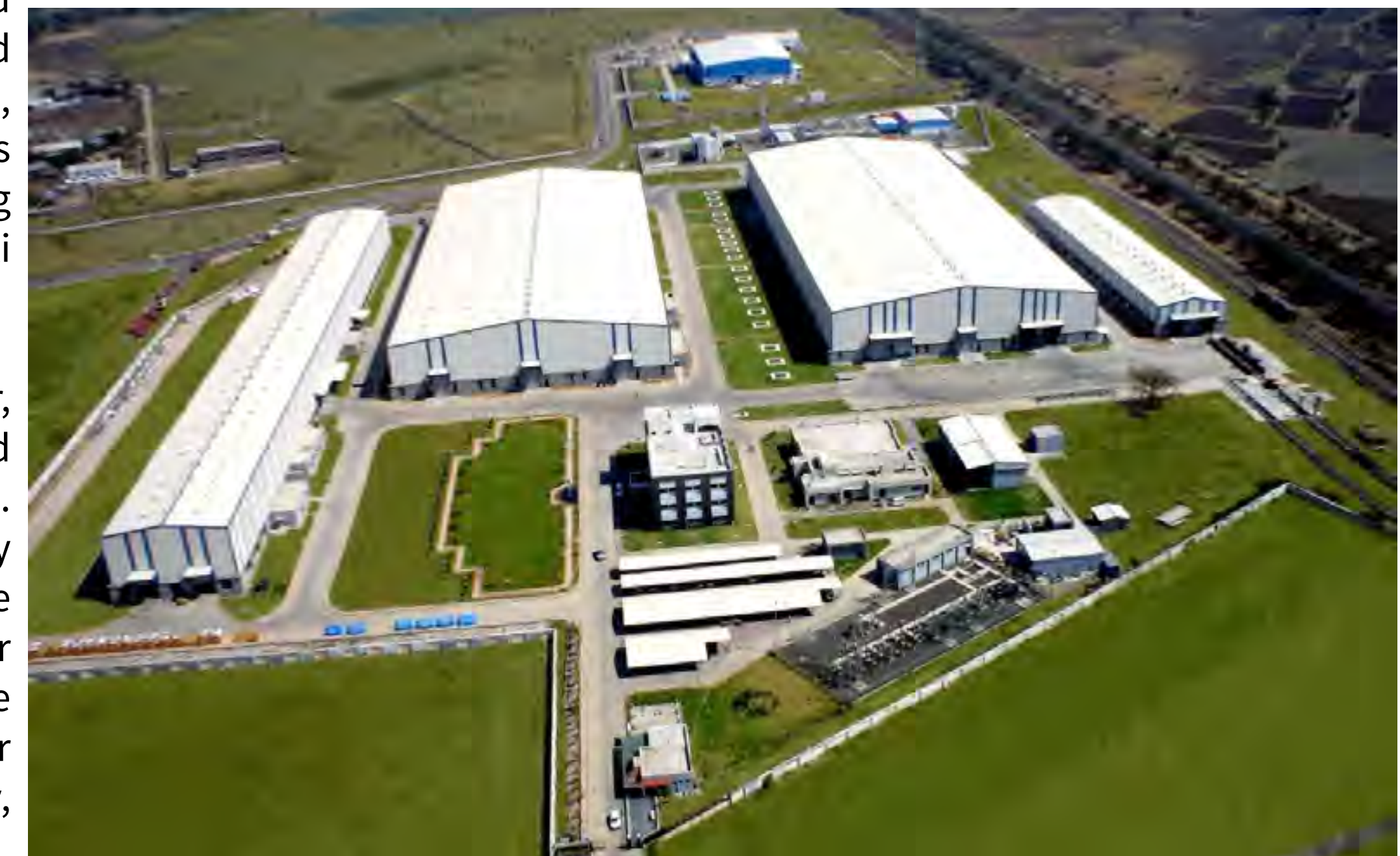
Photo: Bombardier's Savli site near Vadodara in India will manufacture the new RRTS trains

The 82-kilometre Delhi-Ghaziabad-Meerut RRTS will boast a 180 kmph design speed for the commuter trains and will be implemented in phases between the cities. It will have 22 RRTS stations, of which 16 will be regional stations and the other six stations will be in Meerut. The trains will reduce travel time on the Delhi to Meerut line by 75% to around 62 minutes and the daily expected ridership is around 800,000 passengers. The 18-kilometre long metro stretch between Modipuram and Meerut South stations with 12 stations on RRTS infrastructure will meet the local mobility needs of Meerut citizens and will provide efficient regional connectivity.