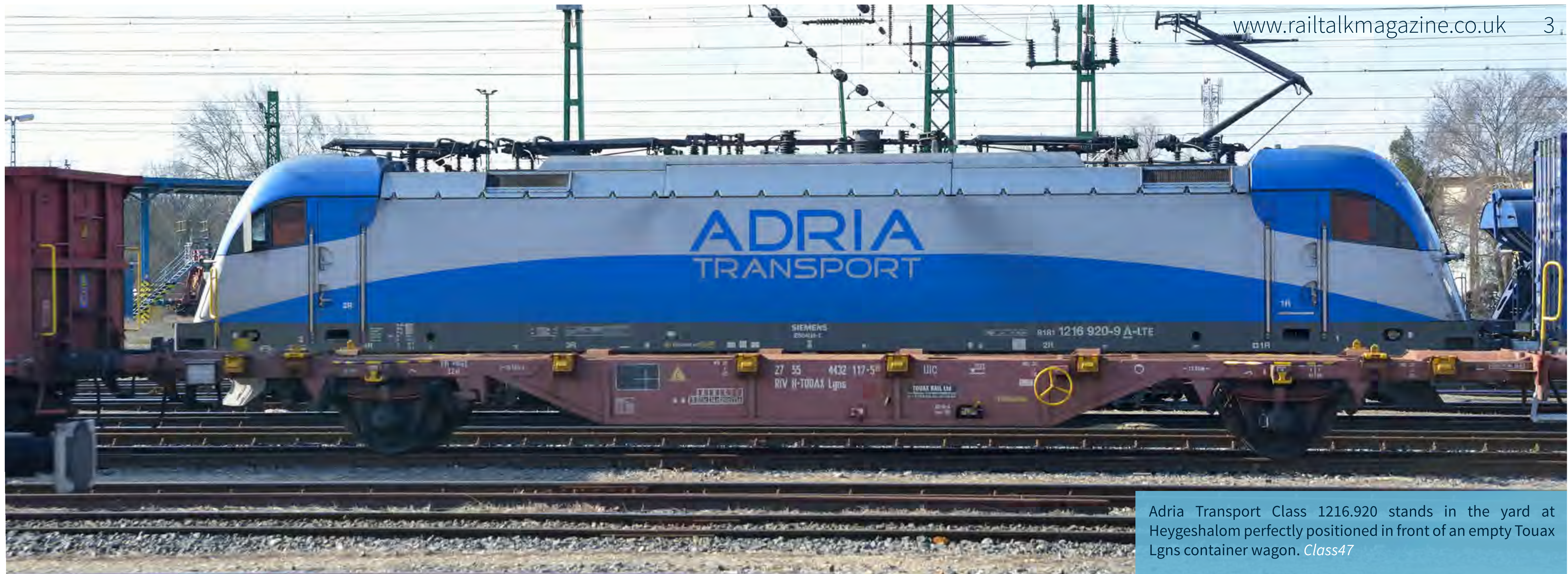
Adria Transport Class 1216.920 stands in the yard at Heygeshalom perfectly positioned in front of an empty Touax Lgns container wagon. Class47