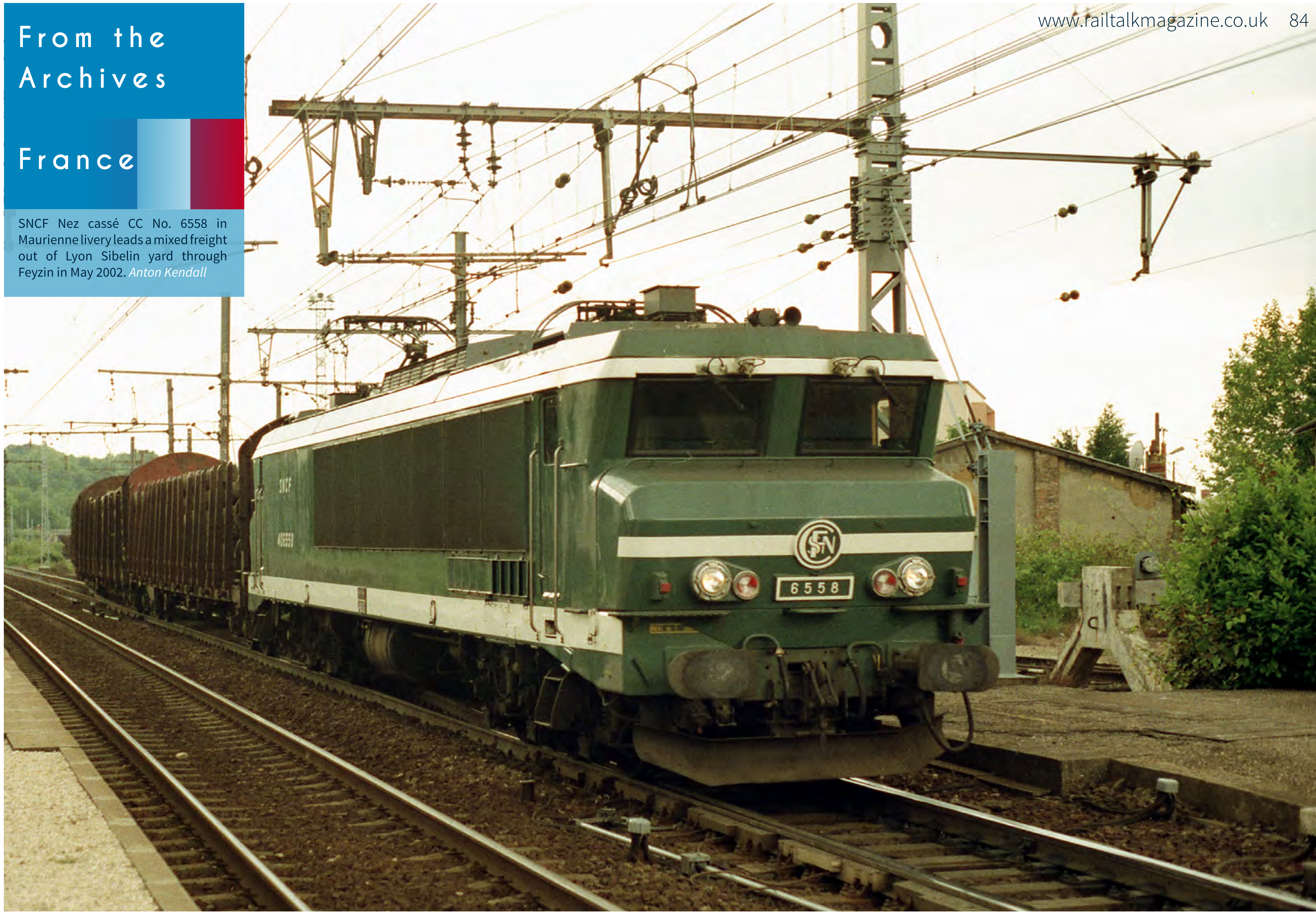
SNCF Nez cassé CC No. 6558 in Maurienne livery leads a mixed freight out of Lyon Sibelin yard through Feyzin in May 2002. Anton Kendall