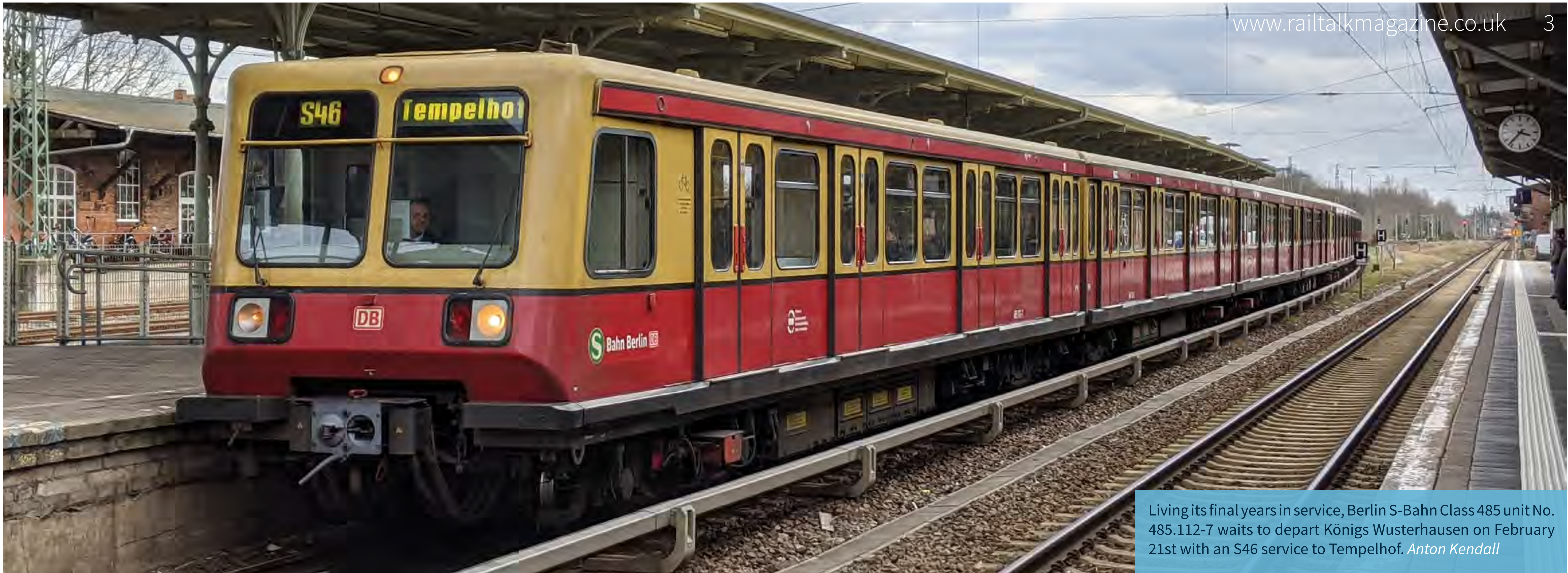
Living its final years in service, Berlin S-Bahn Class 485 unit No. 485.112-7 waits to depart Königs Wusterhausen on February 21st with an S46 service to Tempelhof.